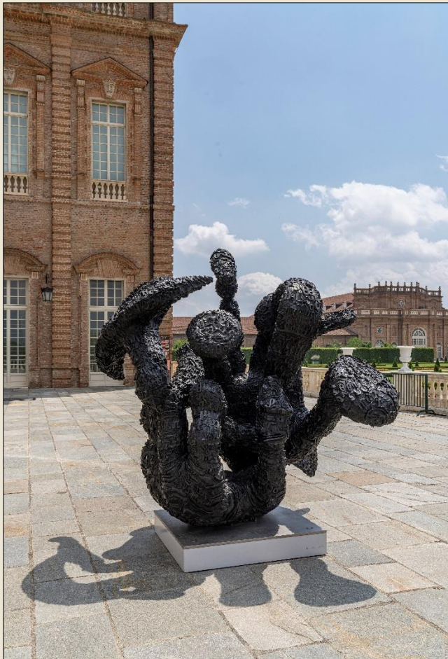
Tony Cragg, Manipulation , 2008 Bronze, 225 x 224 x 240 cm Courtesy of the artist Photo by Pino Dell'Aquila

Tony Cragg's work explores the multiple relationships existing between human beings and the environment. Using a wide selection of materials and sculptural techniques, the artist thematises the complex connection between the figure , the object and the landscape which, in Cragg's view, includes both geological and microbiological systems as well as urban and industrial contexts.