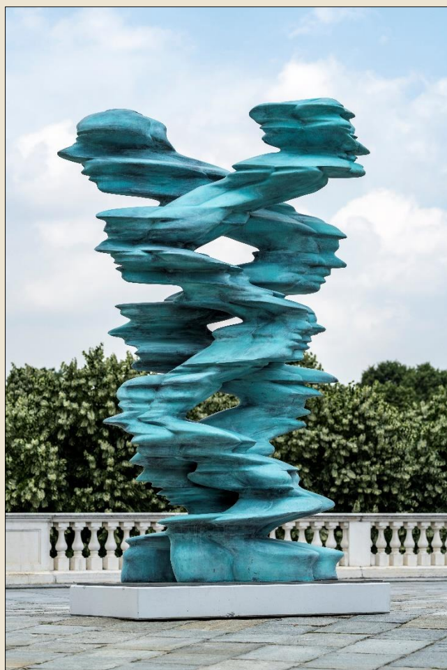
Tony Cragg, Runner , 2015 Bronze, 420 x 280 x 158 cm

After a 16-year-long absence, Cragg returns to Turin, invited by Guido Curto, the general director of the Consortium of Royal Savoy Residences, to hold an exhibition at Reggia di Venaria. From 9 June 2022 to 8 January 2023 a selection of ten sculptures created between 1997 and 2021 will be placed along the permanent exhibition tour of the Reggia that starts from the Court of Honour, passes through the Upper Park of the Reggia's Gardens and ends in the atrium of the Juvarra Stables.