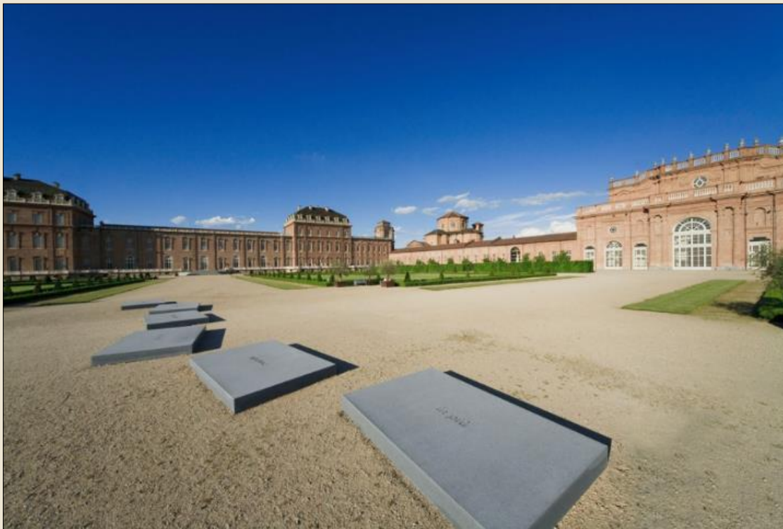
Giovanni Anselmo, Where the stars are coming one span closer , 2001-2013 Six slabs of African Black granite with inscriptions. Reggia di Venaria, Upper Park, Juvarra's Grand Parterre

Alongside Tony Cragg's exhibition stands the work Dove le stelle si avvicinano di una spanna in più ( Where the stars are coming one span closer ) by Giovanni Anselmo, another great contemporary master whose works have been exhibited at Venaria for a long time. This sculpture, despite having been permanently exhibited in the centre of the Gardens' Grand Parterre for several years, has never had an official presentation to date.