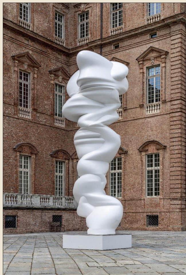
Tony Cragg, Senders , 2018 Fibreglass, 650 x 290 x 250 cm

Shaped using various materials such as bronze, wood, fibreglass and steel, these large works all feature the typical wavy and sinuous lines that seem fashioned on a gigantic potter's lathe and recall the genius loci of the Reggia in a sort of post-modern redefinition of the Baroque and Rococo style.