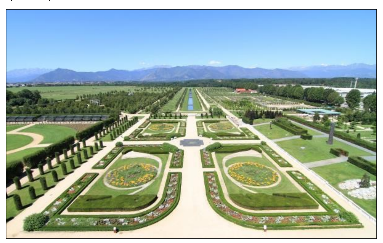
La Venaria Reale, declared part of UNESCO's World Heritage, lies at the heart of the Circuit of Royal Residences of Piedmont and it is connected to Turin's Museum District.

At the turn of the century, this 80-hectare area was so badly damaged as to prevent even the perception of the Gardens' original 17th-18th century layout. A complex restoration project has led, over a period of eight years, to the reconstruction of the landscape and its historical landmarks with an eye towards modern aesthetics and contemporary needs: more than 170,000 new plants are now in place, next to important art-works by the contemporary masters Giuseppe Penone ( The Garden of Fluid Sculptures and Anaphora ) and Giovanni Anselmo ( Where the Stars are coming one span closer ).